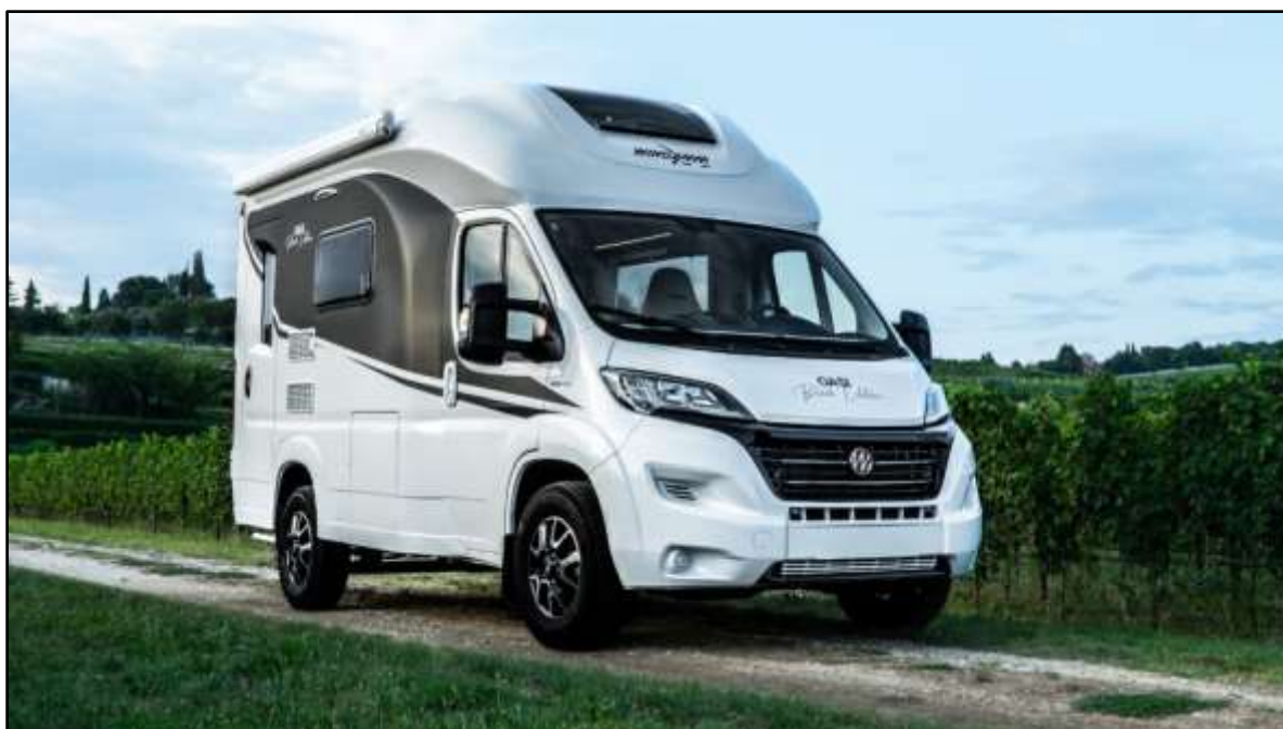
WINGAMM OASI 540....Page 27

Canadian Appreciation Weekend Coming Soon...Page 23