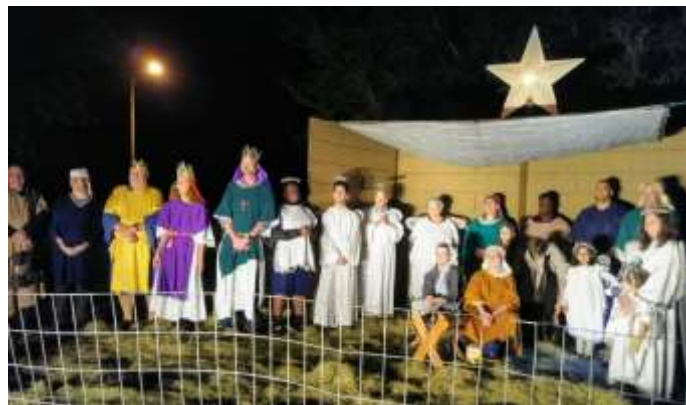
Live Christmas display from past year